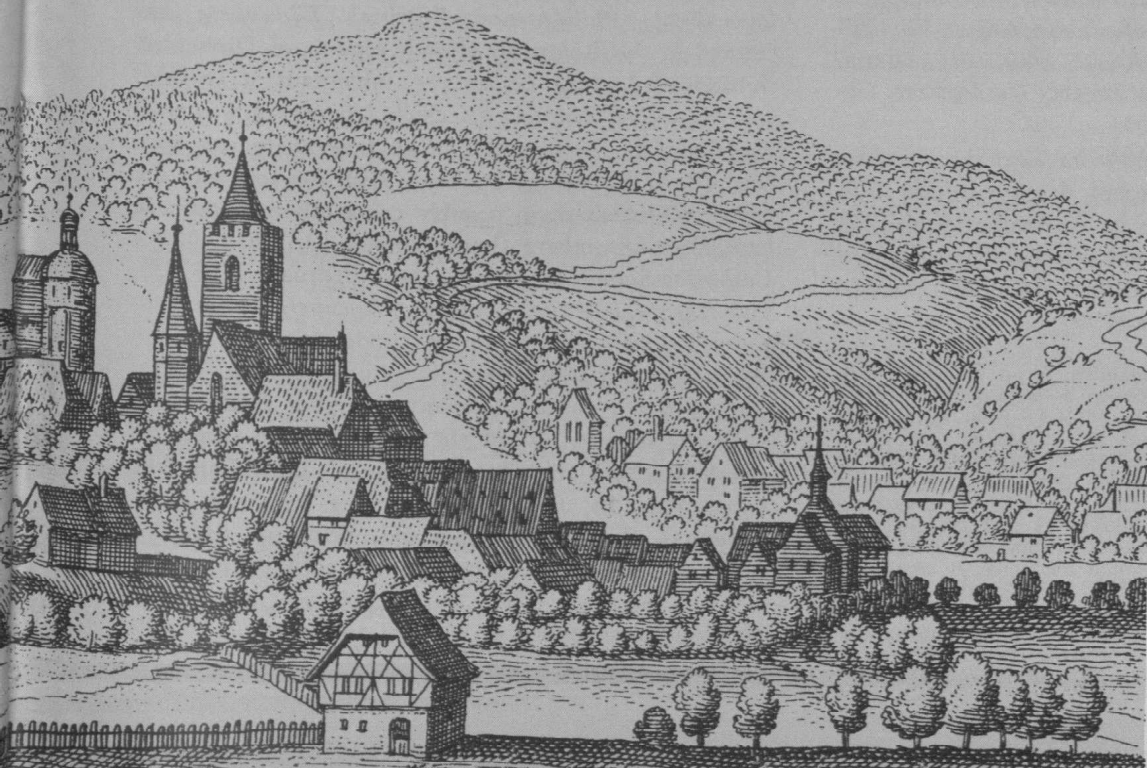
Dürkheim in the Palatinate from Merian's Topographia Germaniae (1672).